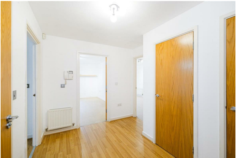
GROUND FLOOR 860 sq.ft. (79.9 sq.m.) approx.